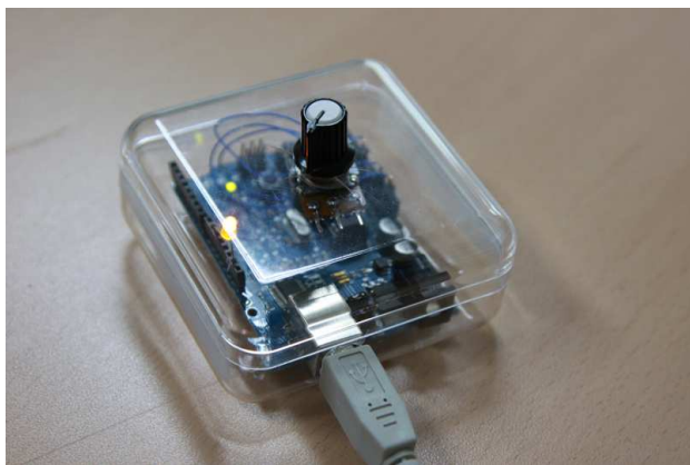
Figure 3. The Drummer-Machine, a hardware patch to augment the performance of the Drummer

To address this problem we prototyped a small piece of hardware called the Drummer Machine , which is composed of a knob, an Arduino board [23], and a USB port attached to a computer (Figure 3). The knob provides the control over the speed of consecutive hits on an instrument without actually having to tap the stylus on the screen repeatedly. This, however, represents only the first attempt to obtain the solution and we will continue to look for better ways to integrate this functionality in the Drummer.