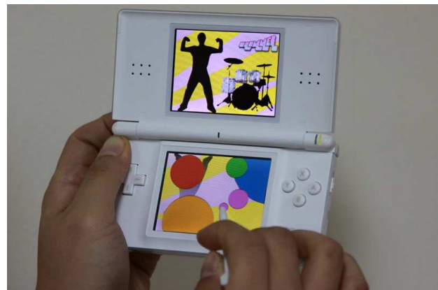
Figure 1. The Drummer client running on a Nintendo DS

The Drummer is a networked digital musical interface that allows multiple users to design and play a drum kit. The system is based on client-server architecture over a wireless network; every client (see Figure 1) runs on a Nintendo DS (Dual Screen) – one of the most popular wireless handheld game devices with touch-screen functionality [1] – while the server computer handles the clients' requests and plays matching drum sounds with the software synthesizer. Each user can take advantage of this small and intuitive pen-based device in order to create/customize a drum kit, and then perform together with other users simply by tapping and sliding the pen on the screen.