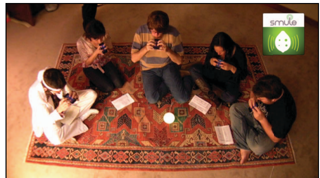
Figure 1. An ensemble of iPhone Ocarina players, rendering the introduction to Led Zeppelin’s Stairway to Heaven.

However, the described interface is only half of the instrument. Ocarina is also a unique social artifact, allowing its user to hear other Ocarina players throughout the world while seeing their location – achieved through GPS and the persistent data connection on the iPhone. The instrument captures salient gestural information that can be compactly transmitted, stored, and precisely rendered into sound in the instrument’s World Listener , presenting a different way to play and share music. In the first six months since its release in November 2008, Ocarina has been downloaded and played on more a million devices, while its users have collectively listened to more than 20 million performances.