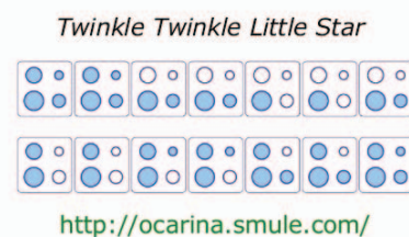
Figure 6. An example of Smule’s Ocarina tablature: the beginning of Twinkle, Twinkle, Little Star.

In addition to the experience on the mobile device, Smule’s Ocarina has a web portal [14] dedicated for users to generate and share musical scores. Since November 2008, users of the Ocarina have authored more than 1200 scores using our custom Ocarina tablature (Figure 6), serving millions of views. User-generated scores include video game music (e.g., Legend of Zelda Theme Song , Super Mario Bros. Theme ), western classical melodies (e.g., Ode to Joy , Blue Danube , Adagio for Strings ), to rock classics (e.g., Yesterday by the Beatles, Final Countdown by Europe), to show tunes, holiday music, and more.