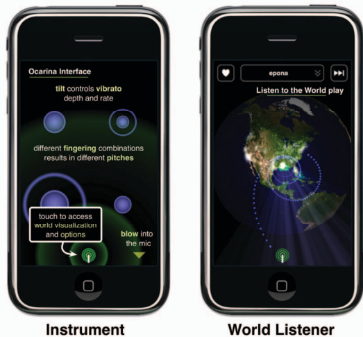
Figure 4. Screenshots of the instrument and the World Listener .

fingering. For example, the Smule Ocarina allows the player to choose the root key and mode (e.g., Ionian, Dorian, Phrygian, etc.), the latter offering alternate mappings to the fingering.