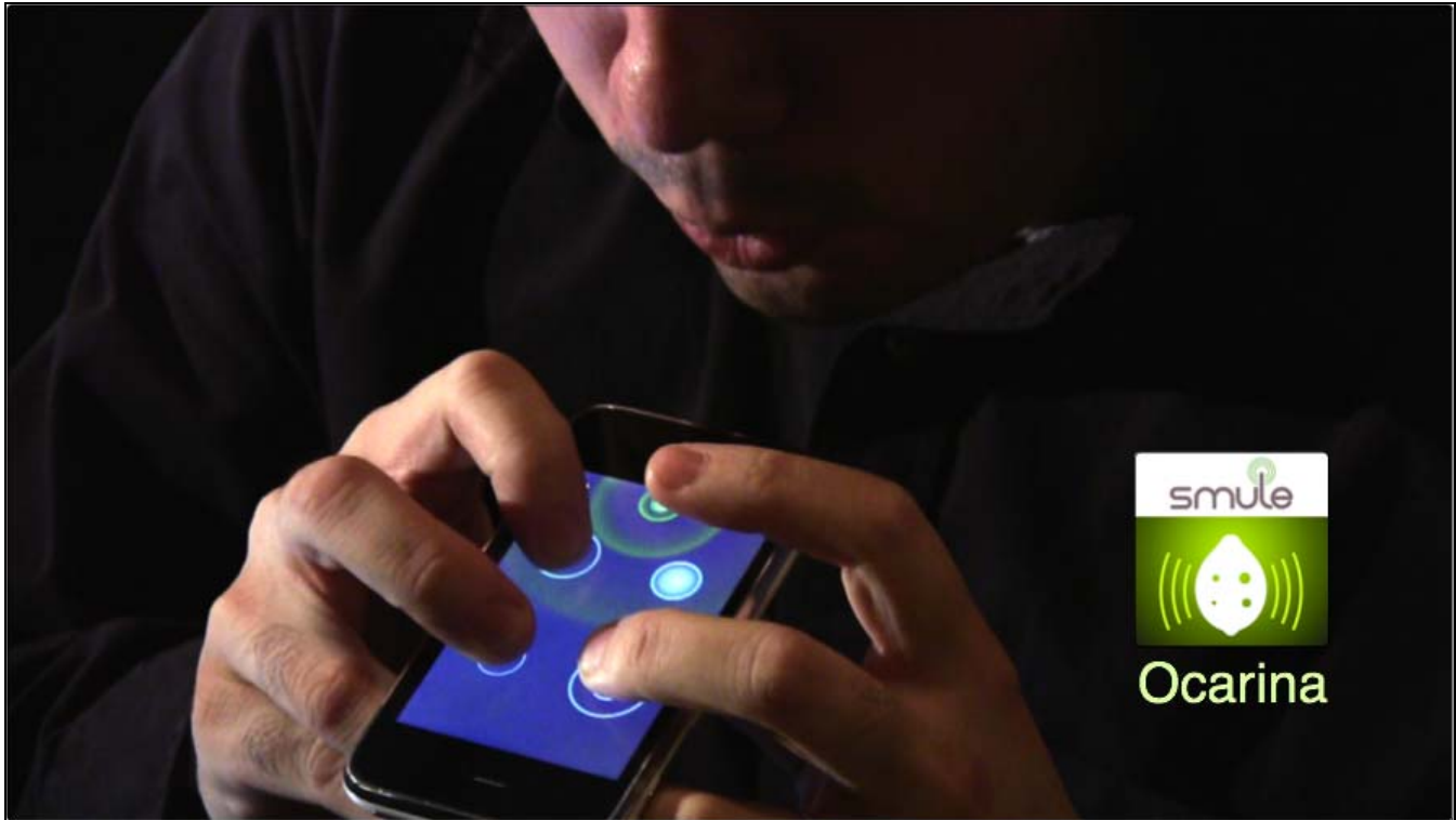
Figure 2. Smule’s Ocarina in action. The player blows into the microphone, while using different fingerings to control pitch, and the accelerometer to control vibrato. Players can hear one another around the world, via GPS and a centralized network.