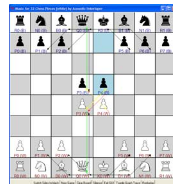
Figure 2. Piece-to-piece relationships, shown by arrows.

This modular software architecture supports composition, improvisation and performance. One form of composition entails writing a software composition plugin that maps game structures to musical structures. Another form of composition entails writing an audio renderer in a sound generation language. This renderer translates the musical structures mapped by the composition plugin into sound.